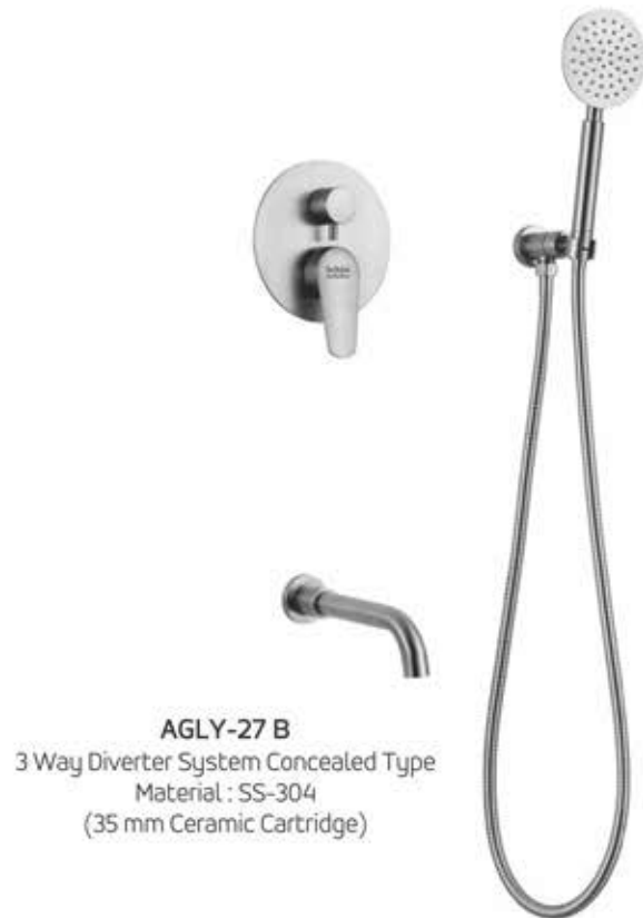
AGLY-27 B 3 Way Diverter System Concealed Type Material : SS-304 (35 mm Ceramic Cartridge)