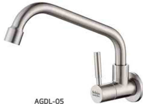
AGDL-05 Cold Water Tap Material : SS-304