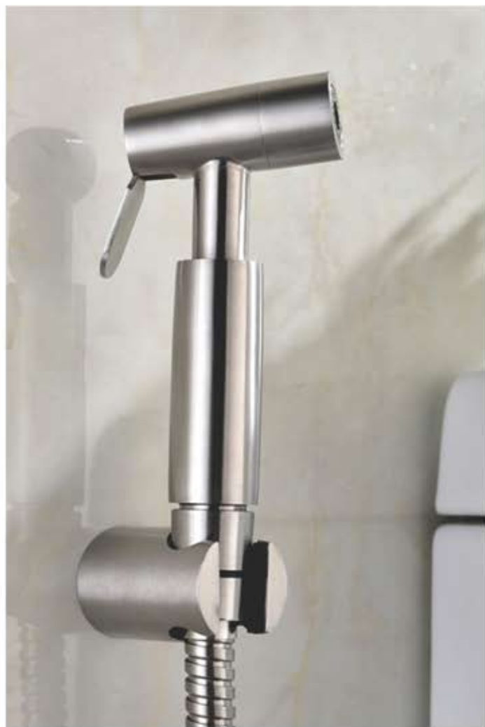
SM-101 Health Faucet Material : SS-304 BIDET SPRAY SETS