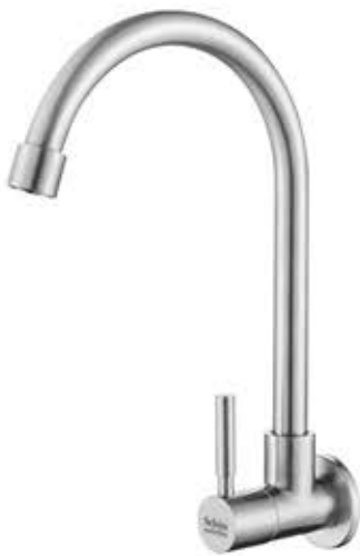
AGDL-04 Cold Water Tap Material : SS-304