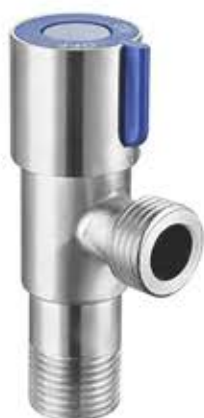
JF-05 Angle Valve