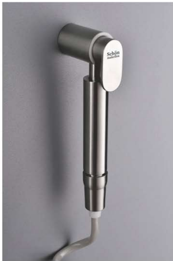
LJ-P081-3 Health Faucet Material : SS-304 BIDET SPRAY SETS