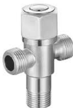
JF-04 Two Way Angle Valve