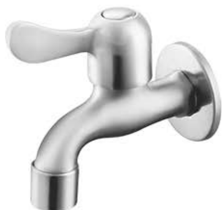
KK-01 Bib Cock Material : SS-304