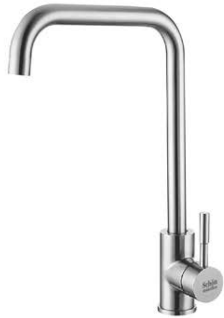
AGCP-04 Single Lever Sink Mixer Material : SS-304 Aerator : Neoperl ( Switzerland ) , Premium Sedal / Equivalent Cartridge.