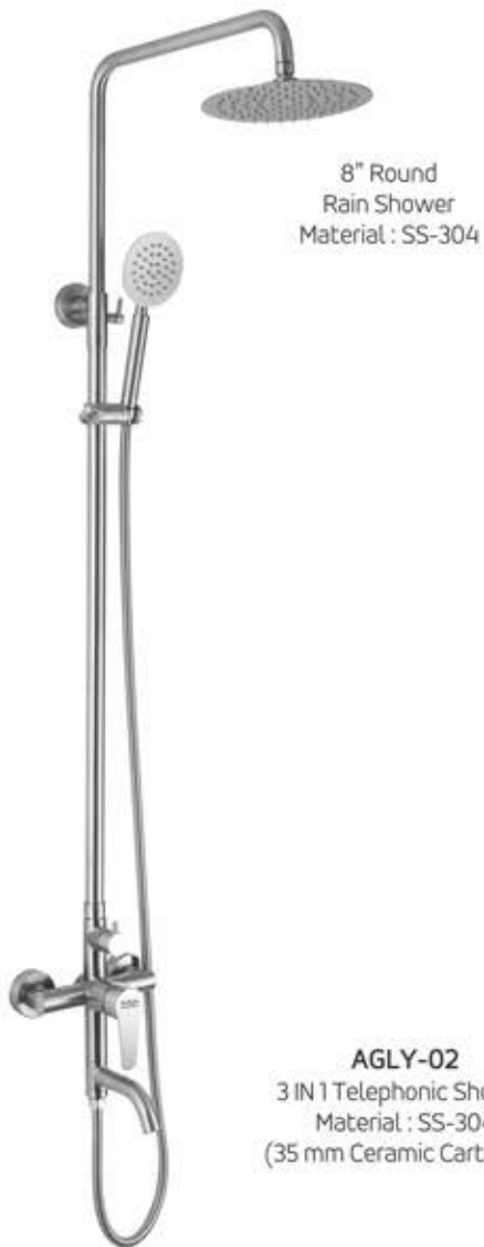
8" Round Rain Shower Material : SS-304