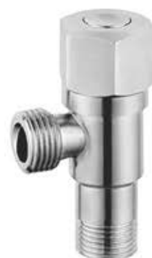
JF-03 Angle Valve