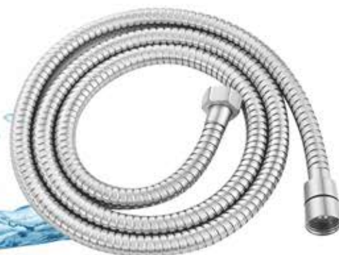
LJ-S901 Shower Pipe Material : SS-304