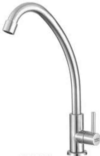
AGDL-02 Cold Water Tap Material : SS-304