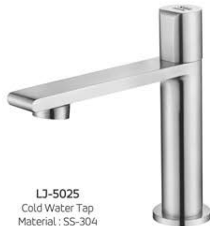
LJ-5025 Cold Water Tap Material : SS-304