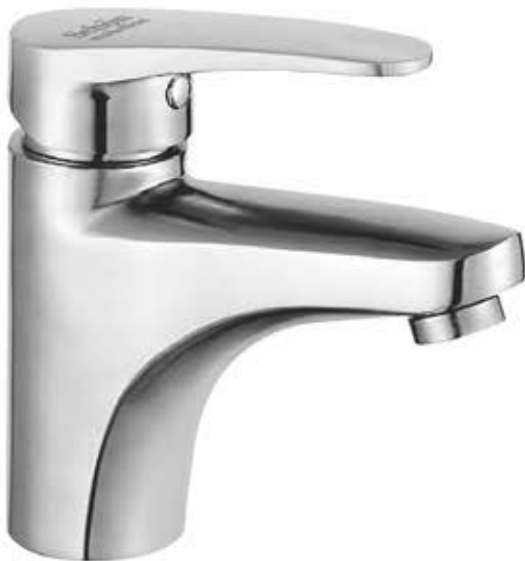
AGLP-15 Single Lever Basin Mixer Material : SS-304 Aerator : Neoperl ( Switzerland ) , Premium Sedal / Equivalent Cartridge.