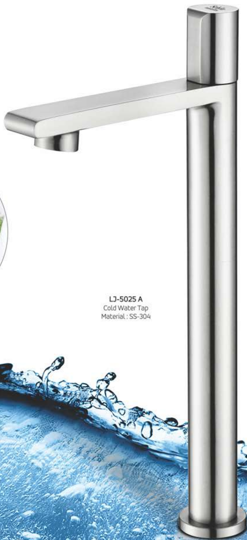
LJ-5025 A Cold Water Tap Material : SS-304