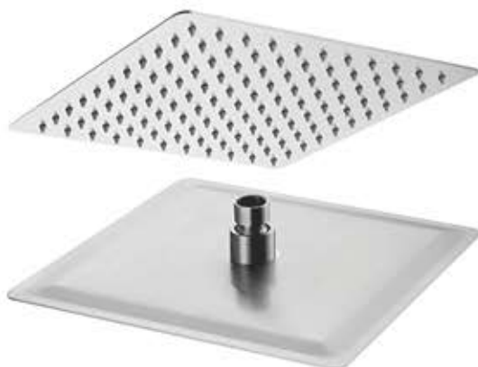
P-07 8" Square Rain Shower Material : SS-304