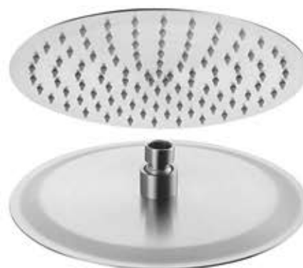
P-08 8" Round Rain Shower Material : SS-304