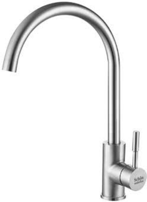
AGCP-01 Single Lever Sink Mixer Material : SS-304 Aerator : Neoperl ( Switzerland ) , Premium Sedal / Equivalent Cartridge.