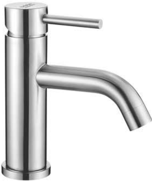
LJ-9001 Single Lever Basin Mixer Material : SS-304 Aerator : Neoperl ( Switzerland ) , Premium Sedal / Equivalent Cartridge.