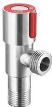
JF-05 Angle Valve