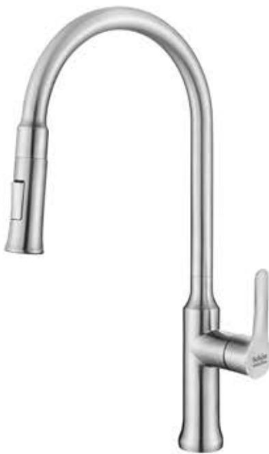
LJ-8038 Single Lever Sink Mixer Material : SS-304 Aerator : Neoperl ( Switzerland ) , Premium Sedal / Equivalent Cartridge.