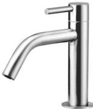
AGDL-08 Cold Water Tap Material : SS-304