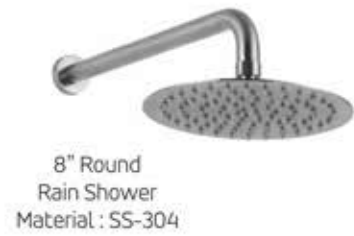
8" Round Rain Shower Material : SS-304