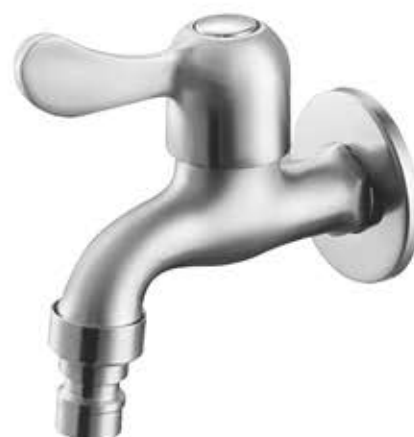
XYJ01 Bib Cock Nozzle Material : SS-304