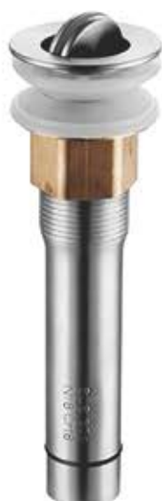
X-03 Pop Up Waste