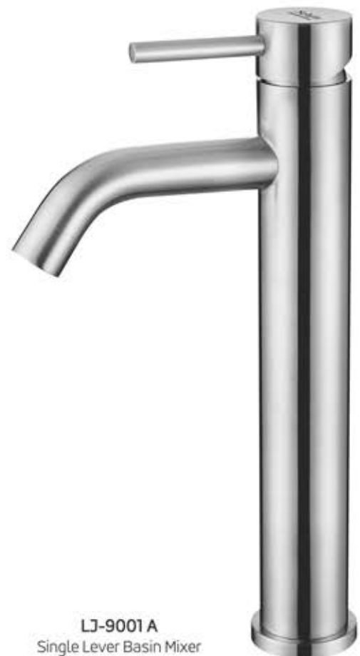
LJ-9001 A Single Lever Basin Mixer Material : SS-304 Aerator : Neoperl ( Switzerland ) , Premium Sedal / Equivalent Cartridge.