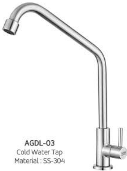
AGDL-03 Cold Water Tap Material : SS-304