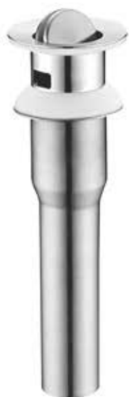
X-02 Pop Up Waste