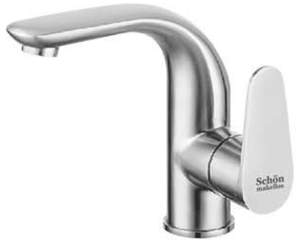
AGLP-20 Single Lever Basin Mixer Material : SS-304 Aerator : Neoperl ( Switzerland ) , Premium Sedal / Equivalent Cartridge.