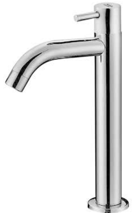
AGDL-08G Cold Water Tap Material : SS-304