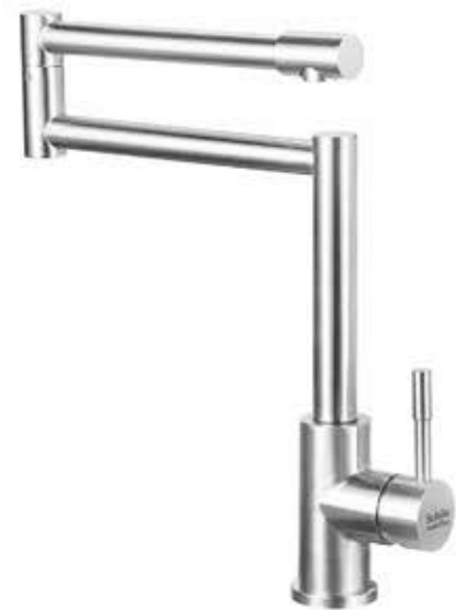
AGCP-09 Single Lever Sink Mixer Material : SS-304 Aerator : Neoperl ( Switzerland ) , Premium Sedal / Equivalent Cartridge.